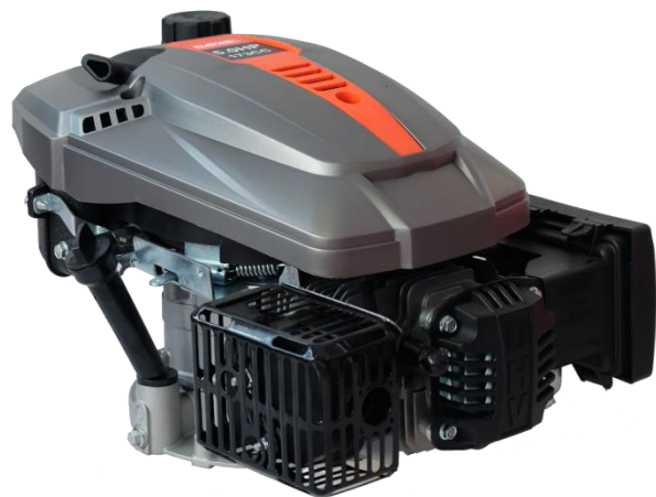
1P70发动机 Engine 1P70

自主开发1P70发动机: Independent development of 1P70 engine: