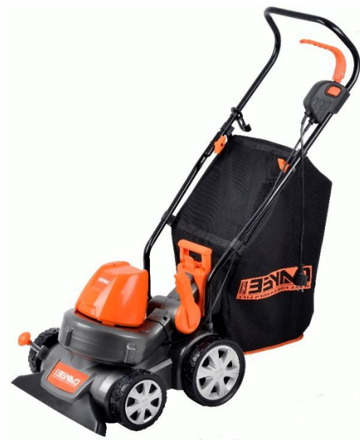
小型电动吹吸机 Small electric vacuum

Cooperated with foreign engineers to develop a small hand-push electric vacuum & blower: