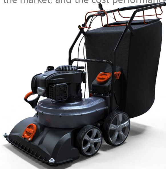
大规模吹吸机 Large-scale blower

开发了大吹吸机。性能、功能超越市场上的同类产品，性价比极高： Developed a large blower. Performance and function exceed the similar products on the market, and the cost performance is extremely high: