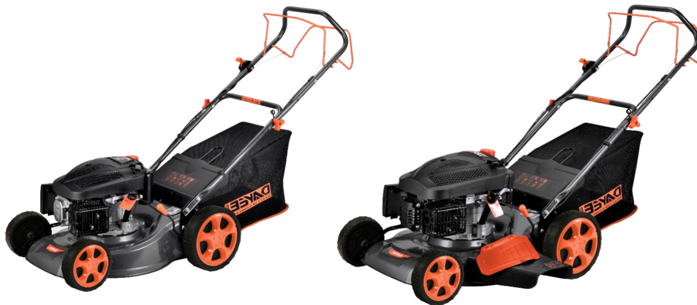
18吋和20吋高排草割草机 18" and 20" high deck lawn mowers

同国外客户合作开发了18吋，20吋高质量高排草割草机： Developed 18', 20' high quality high discharge mowers in cooperation with foreign customers