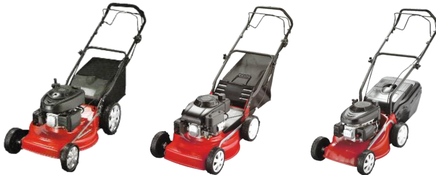
16吋塑料底盘汽油割草机与18吋、20吋汽油割草机 16 " plastic chassis and 18" , 20" petrol mower

收购了上海星浩特割草机工厂，其中产品有： Acquired Shanghai Xingtehao mower factory, including products: