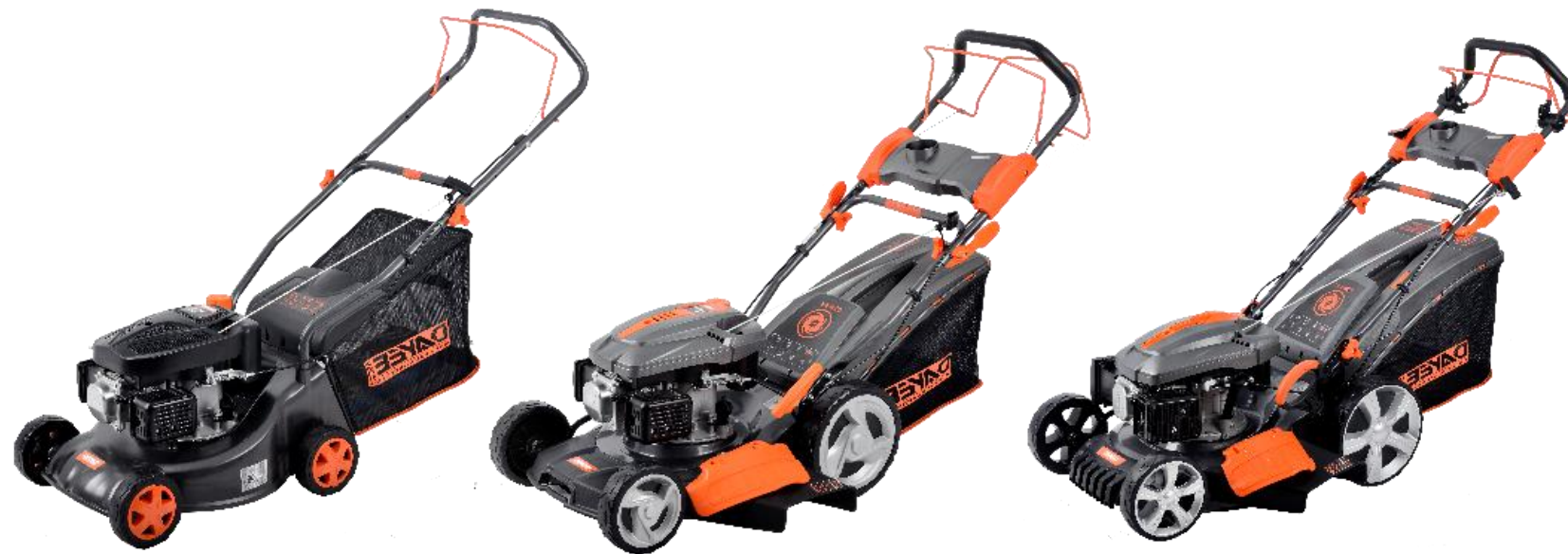
3系，5系，5+系割草机 3 series, 5 series, 5+ series lawn mower

用宝马的理念，宝马的质量对原有割草机产品进行分类定位： Using the BMW concept, BMW's quality classifies the original mower products: