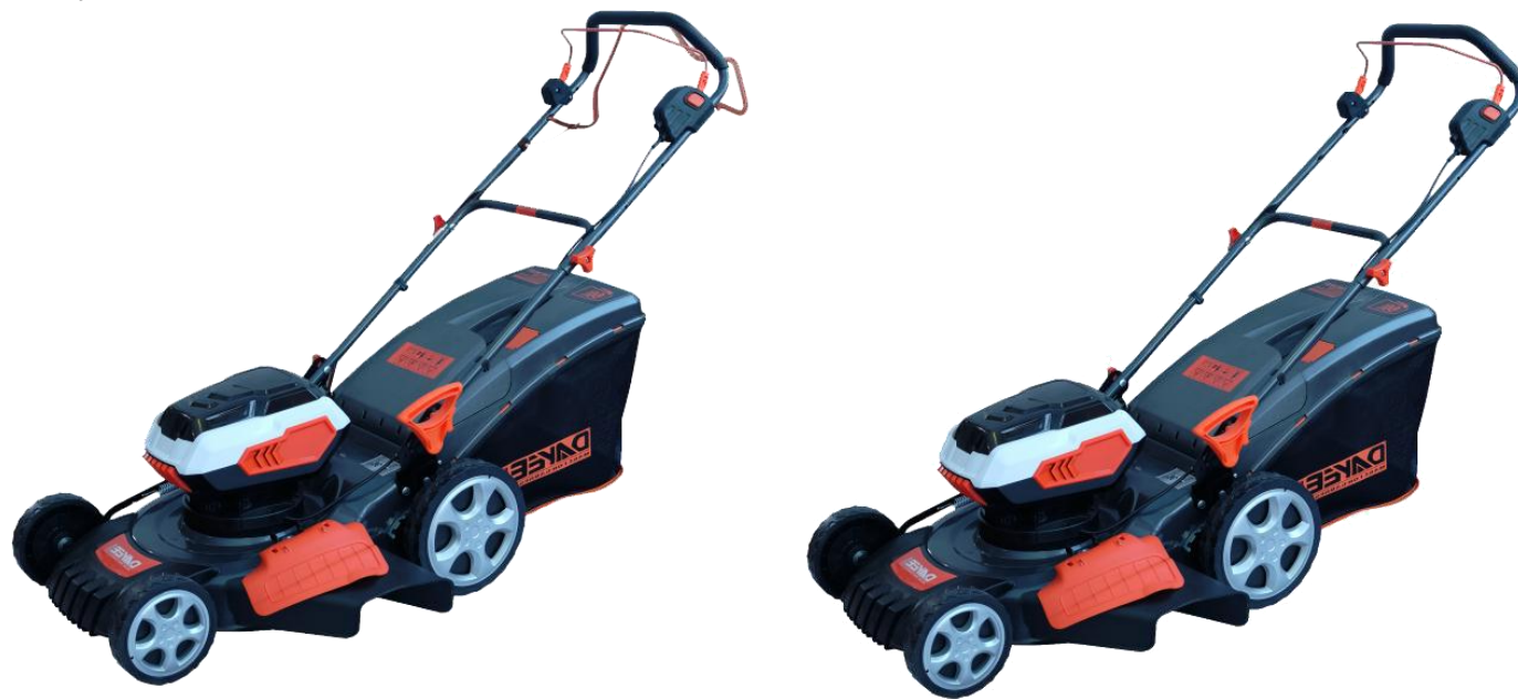
锂电割草机 Lithium battery lawn mower

同浙江白马合作，开发锂电割草机，规格有16吋、17吋、18吋、19吋和20吋： Cooperate with sunseeker to develop lithium mowers with specifications of 16', 17', 18', 19' and 20':