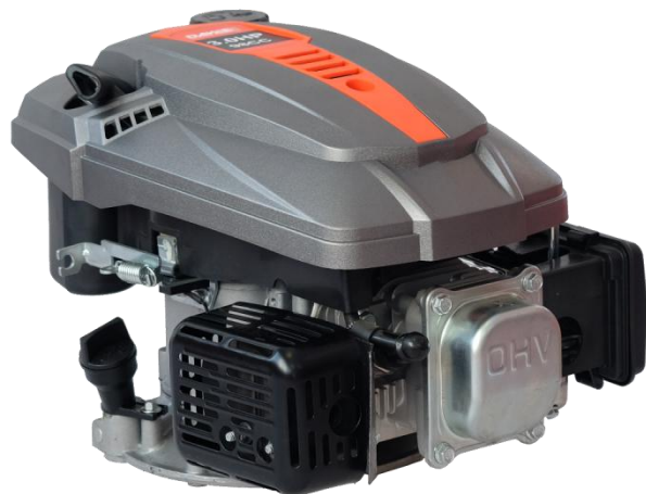
1P56发动机 Engine 1P56

自主开发1P56发动机: Independent development of 1P56 engine: