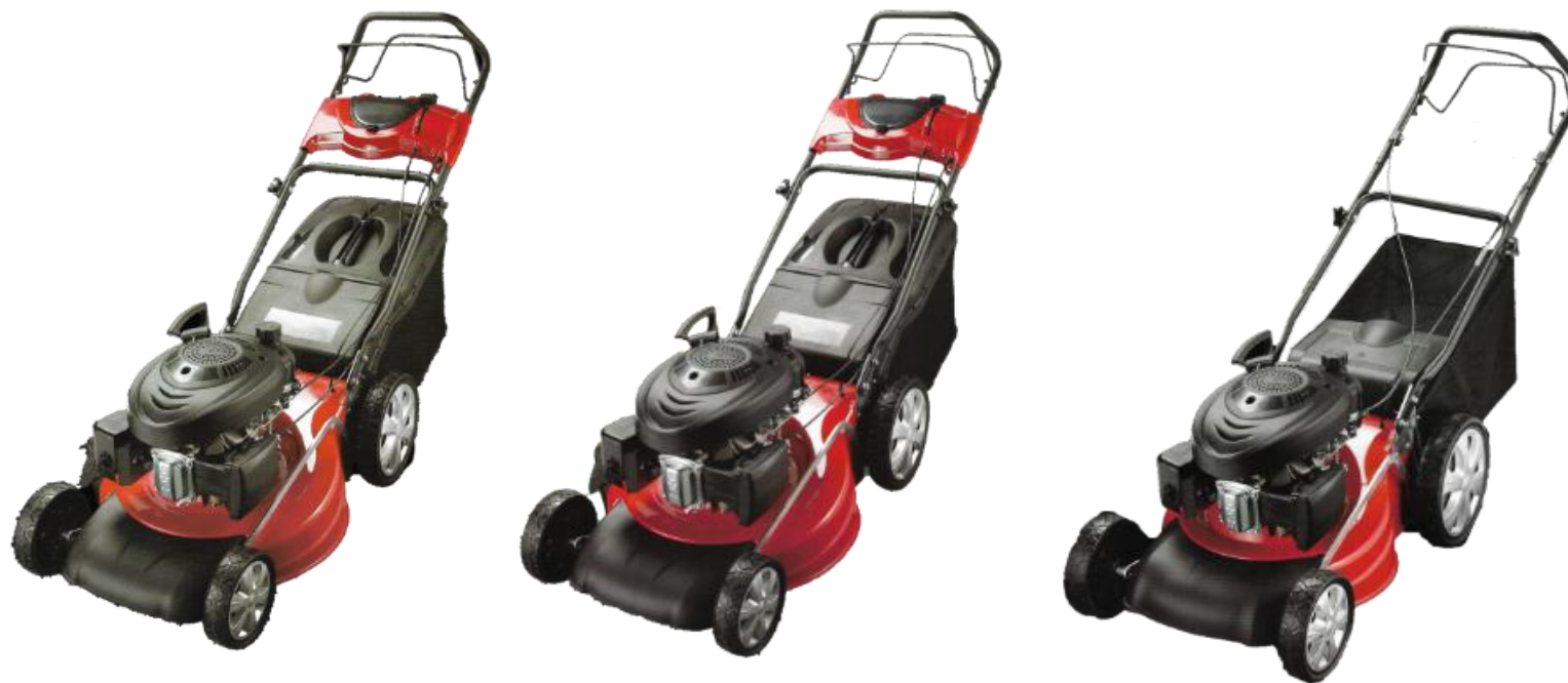
17吋、19吋和21吋高轮豪华割草机 17 ", 19" , 21" high-wheel luxury lawn mower

研发了当时国内首创的17吋、19吋和21吋高轮豪华割草机： Developed the first 17-inch, 19-inch and 21-inch high-end luxury lawn mowers in China at the time: